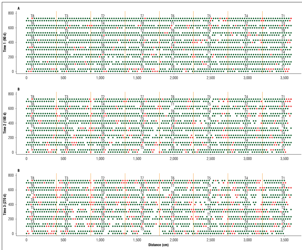
Figure 1. Temporal distribution of the progress of gray mold disease ( B. cinerea ) in strawberry cultivation var. Monterrey (three time), according to treatment with microorganisms: T1, control; T2, T. harzianum (T); T3, antagonistic bacteria - B; T4, mycorrhizal fungi - B; T5, T + B; T6, T + M; T7, B + M; T8, T + B + M. Green circles, healthy plants; red circles, disease plants; white spaces, dead plant and deleted. d, days after the transplant.

the decrease in the number of plants for evaluation, increasing the discontinuity of points, most evident for the evaluation in time 3 (270 d). Dead plants are associated with the disease over time from the second evaluation (180 d). Table 1 presents the incidence values of gray mold for each time evaluation for the distribution of figure 1. For the case of control plants, the incidence had the highest values (6.59, 12.09 and 23.08%, at 90, 180 and 270 d, respectively). By contrast, we saw the lowest disease incidence by mycorrhizal fungi treatment with values of 0.89, 5.78 and 13.78%.