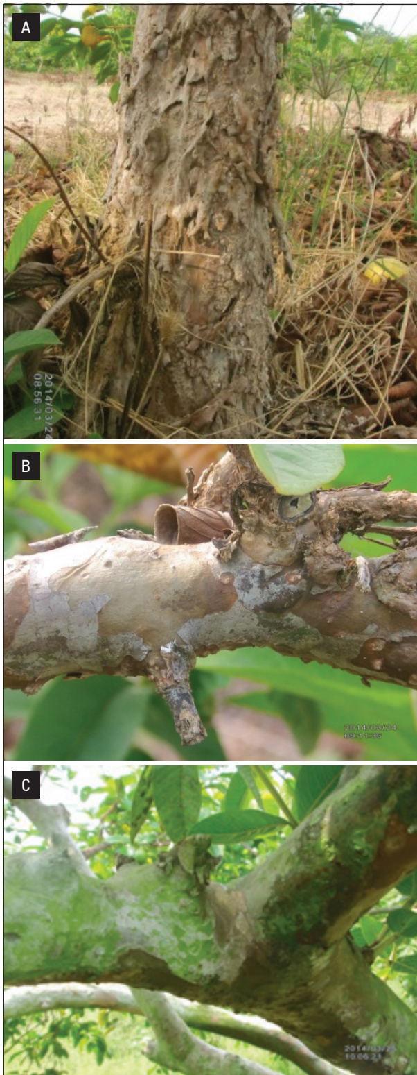
Figure 2. A. Exfoliation of the stem bark. B. Stem necrosis. C. Green algae on the stem of a plant treated with the sulfured-calcium mixture.