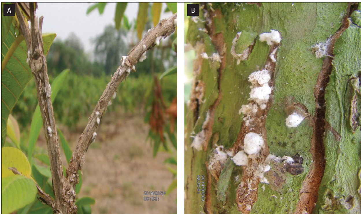
Figure 1. A. Young colony of Capulinia linarosae on a branch. B. Young colony of C. linarosae on a principal stem.

This research was conducted on two farms or production units (PU): Agropecuaria Aranzazu (PU A , 8°48'27" N and 71°46'48" W) and Agropecuaria El Toro