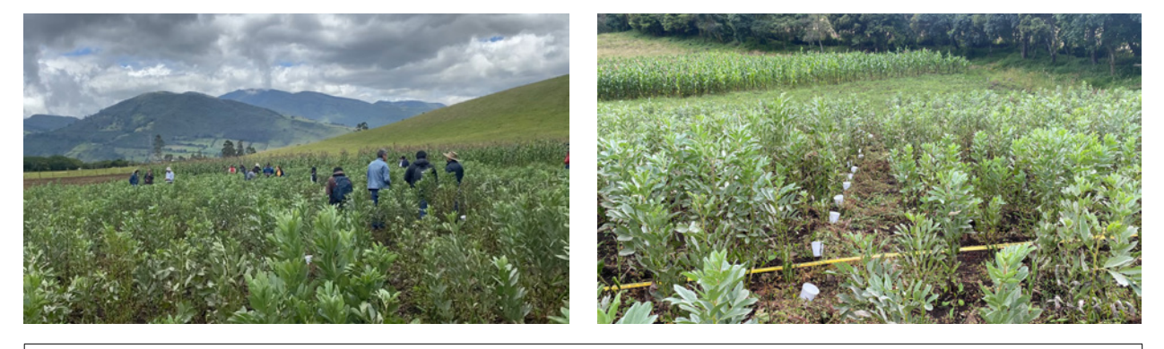
Figure 1. Participatory selection process with farmers (A), and experimental plot view (B).

Similarly, culinary traits that could define a usage profile for Faba bean materials were not explored, as suggested by Mncwango et al. (2021) and Serafin-Andrzejewska et al. (2023).