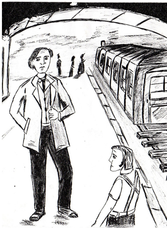
3 Images drawn by the author