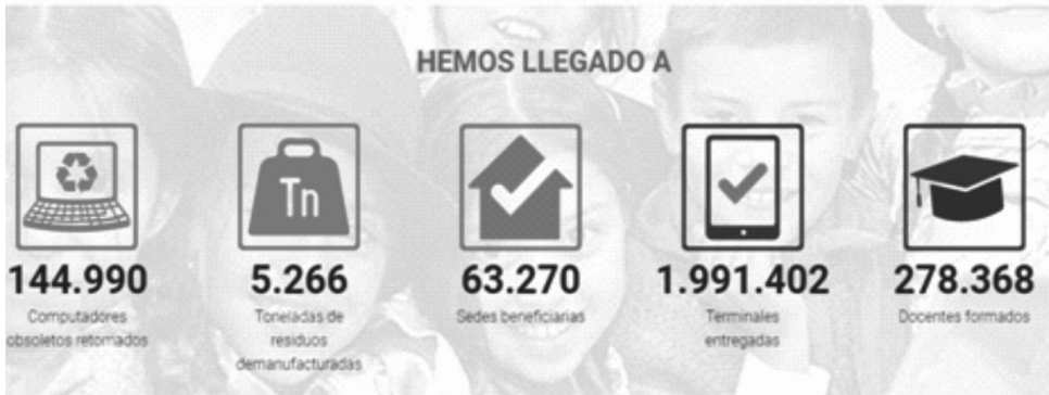
Image 4. Figures of achievements by the governmental program. Source: CPE web page

Finally, due to lack of updating technological hardware, it is often abandoned in storage rooms at the schools. This hardware is not only obsolete, but often damaged and must be disposed of properly by the various entities. Consequently, the need for an explicit policy that regulates the handling, maintenance, and disposal must be clarified. This will help secure the resources needed in rural schools and ensure that the same technological benefits provided to schools in larger municipalities are extended to rural schools.