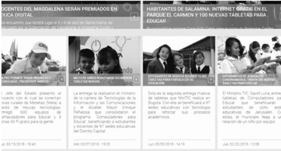
Image 3. Awards given to teachers who complete training and receive tablets.

providing adequate instruction to the staff in charge of the equipment to be used.