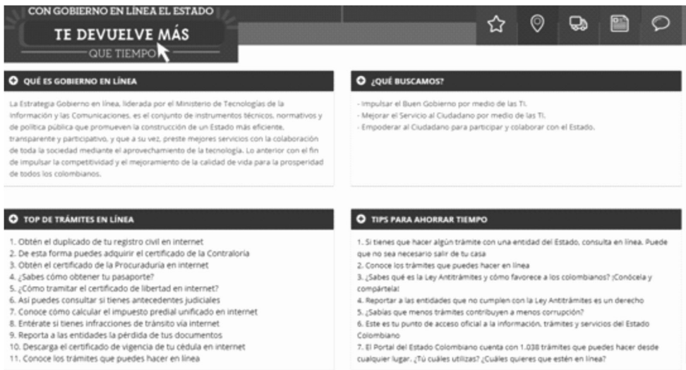
Image 2. GEL webpage exhibits administrative procedures done on-line.