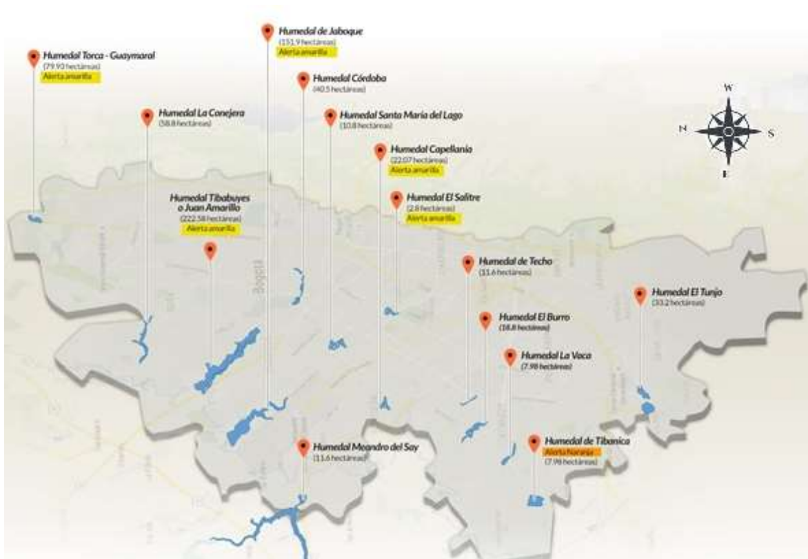
Fig. 1. Known wetlands in Bogota [6].

An estimation of the wetland area of Bogota in 1950, 1989, and 2016 was made through the review of geographic information from the Agustín Codazzi Geographical Institute (IGAC) and the Aqueduct and Sewer Bogotá Company (EAAB). The information was digitized with the help of AutoCAD software in order to perform the analysis of the area variation of these water bodies in the city. Figure 1 shows the location of the wetlands in Bogota– the ones included in the study.