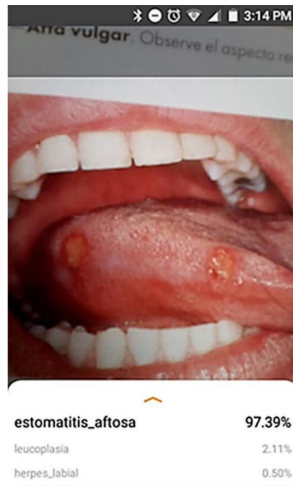
Fig. 1. Screenshot of the running application.